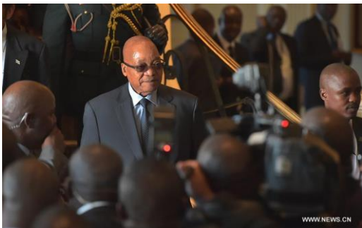
President Jacob Zuma attends the SADC meeting in Gaborone, 18 January 2016.

President Jacob Zuma led the South African delegation to the Extra-ordinary Summit of the SADC Double Troika which was held in Gaborone, Botswana on 18 January 2016. The Summit, comprising Botswana, Zimbabwe, Swaziland, Mozambique, South Africa and Tanzania considered the political and security situation in the SADC region,