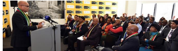
President Zuma briefs Team South Africa at WEF in Davos.