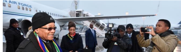
President Zuma arrives at Zurich Int. Airport for 2016 WEF Meeting.

The World Economic Forum was held in Davos, Switzerland from 20-23 January 2016. In his address, President Jacob Zuma informed the gathering of the Invest South Africa initiative which will be introduced in the course of the year.