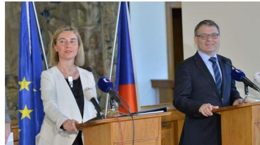
High Representative Federica Mogherini and Minister Zaorálek, Prague, 11 January 2016.

EU Foreign Affairs chief Ms Federica Mogherini met Czech Foreign Minister Lubomír Zaorálek on 11 January 2016 to discuss current security challenges facing the world including migration, the fight against terrorism and the Islamic State. A joint public debate entitled The future of Europe in an Interconnected World was held during her visit.