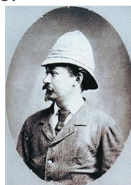
Dr Emil Holub

ethnographer of 19 th century, Dr Emil Holub.