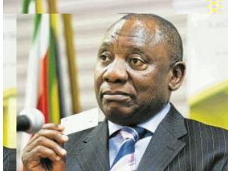
Deputy President Cyril Ramaphosa in Juba, South Sudan

Deputy President Cyril Ramaphosa attended the Conference of the South Sudanese Liberation Movement from 07-08 January 2016. He also paid a courtesy call on South Sudanese President Salva Kiir.