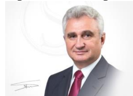
Senate President Milan Štěch

President of Senate Mr Milan Štěch met the Diplomatic Corps on 18 January 2016.