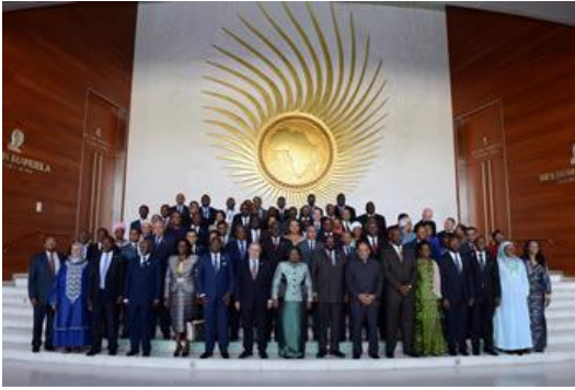
Group photograph of the African Union Executive Council, Addis Ababa, Ethiopia, 27 January 2016.