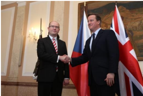
Prime Ministers Bohuslav Sobotka and David Cameron at Straka Academy, Prague, 22 January 2016.

British Prime Minister David Cameron arrived in Prague on 22 January 2016 to meet his counterpart Bohuslav Sobotka, President Miloš Zeman and other top representatives of the Czech Republic. The talks were dominated by Britain's proposals for EU reform, its future in the EU, the migration crisis and business and security cooperation.