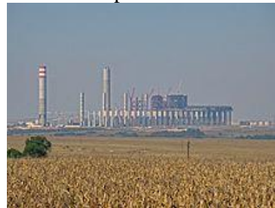
Kusile power plant

Hutní montáže company started assembly of the third boiler at the Kusile coal power plant in South Africa; its completion is scheduled for September 2016. Hutní montáže company, part of the Vítkovice Machinery engineering group has been involved in the construction of the plant since 2013.