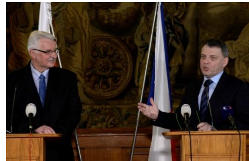
Minister Lubomír Zaorálek and his counterpart Witold Waszczykowski at press conference in Prague on 11 January 2016.